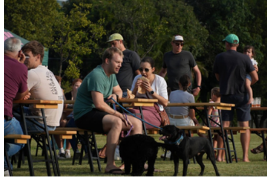
Furry friends were welcome too!