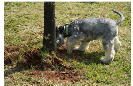
A tail-wagging good time — four-legged residents joined the fun too!