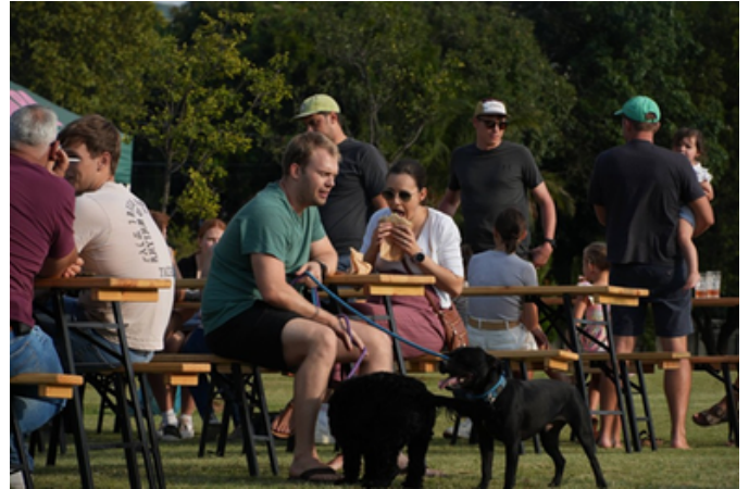
Furry friends were welcome too!