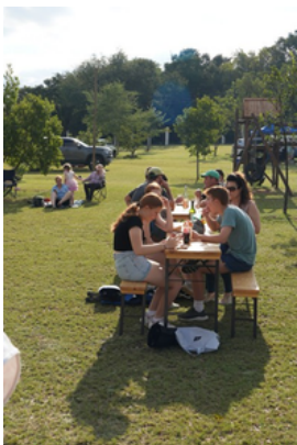
Residents connecting over great food and conversation

A proposal was made to add a birding page to the LSV website. Currently under consideration by the Board.