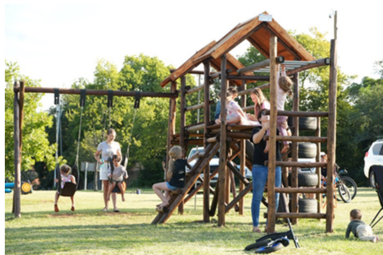
Kids making the most of the jungle gym