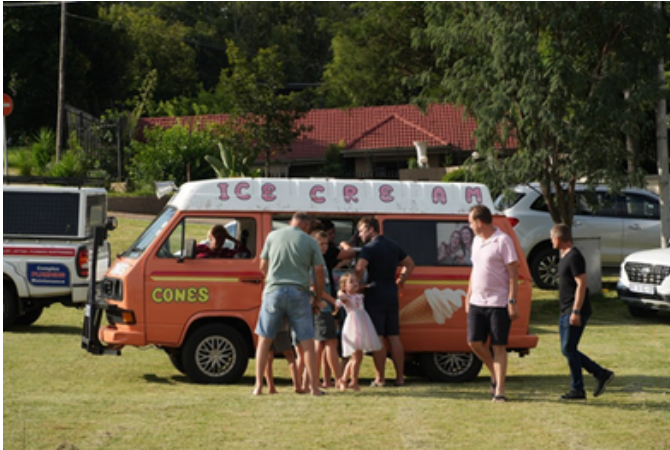
The iconic ice cream van — a crowd favourite!

Our community social held on 8 March was a wonderful success! It was a pleasure to see so many residents come together in a relaxed and festive atmosphere. Events like these are at the heart of what makes Lynnwood South Village such a special place to live.