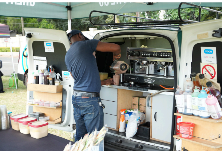
Coffee and Freezoes prepared fresh