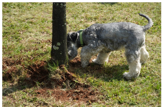
A tail-wagging good time — four-legged residents joined the fun too!