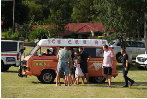
The iconic ice cream van — a crowd favourite!