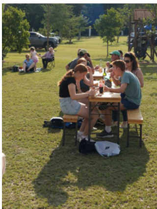
Residents connecting over great food and conversation